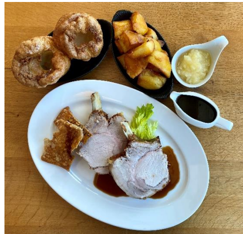
West End Farm pork rack & apple sauce (serves 2) 62.00 1, 2, 4, 7, 13