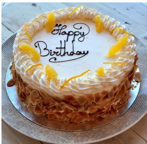
Celebration "Penny Coco" coconut cake (v) 36.00 (serves 4) 72.00 (serves 8) 2, 4, 7, 13, 14