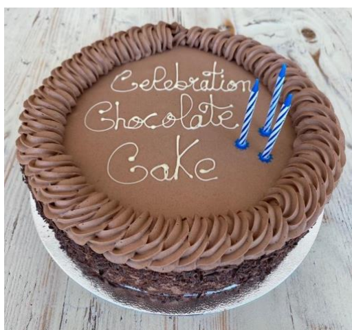
Celebration chocolate cake (v) 36.00 (serves 4) 72.00 (serves 8) 2, 4, 7, 13, 14