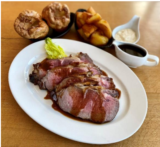
Beef striploin & horseradish (serves 2) 67.00 1, 2, 4, 7, 13